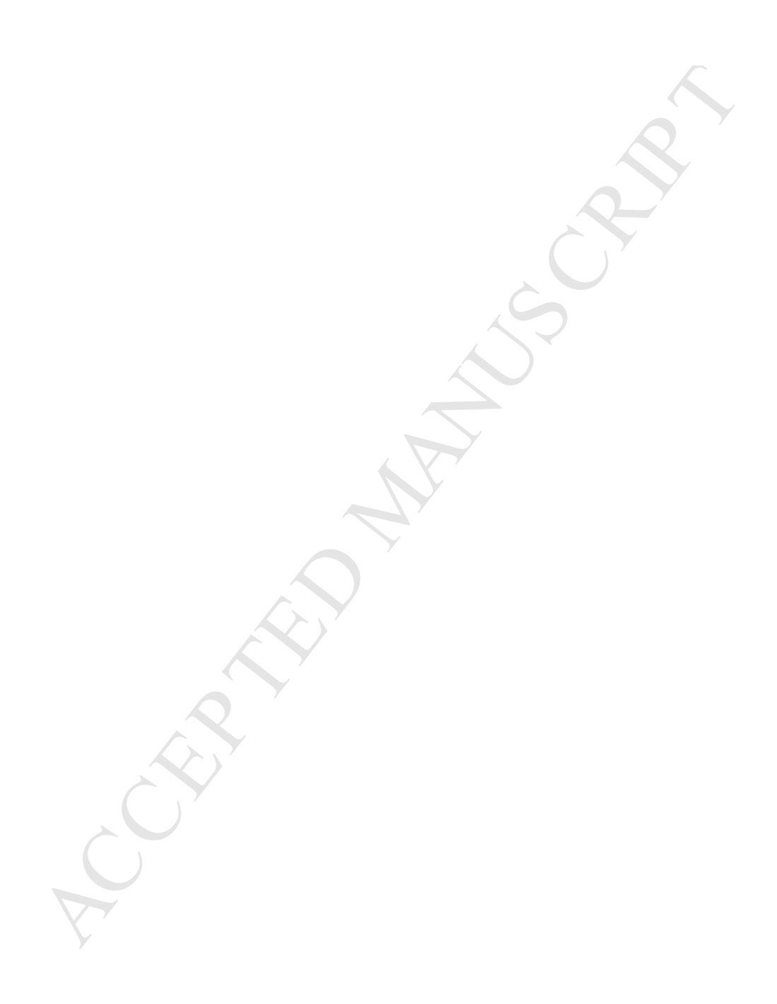
Table 1 Descriptive statistics of individual and provincial level variables without centering and scaling